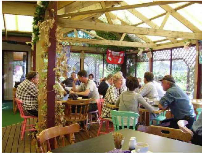
A trip to the Flying Teapot, near Bridport: always a popular fly-in.

Regular visits to other airfields are always a popular event whether travelling by air or by road. The opportunity to catch up with friends while enjoying a delicious barbecue is great way to spend time.