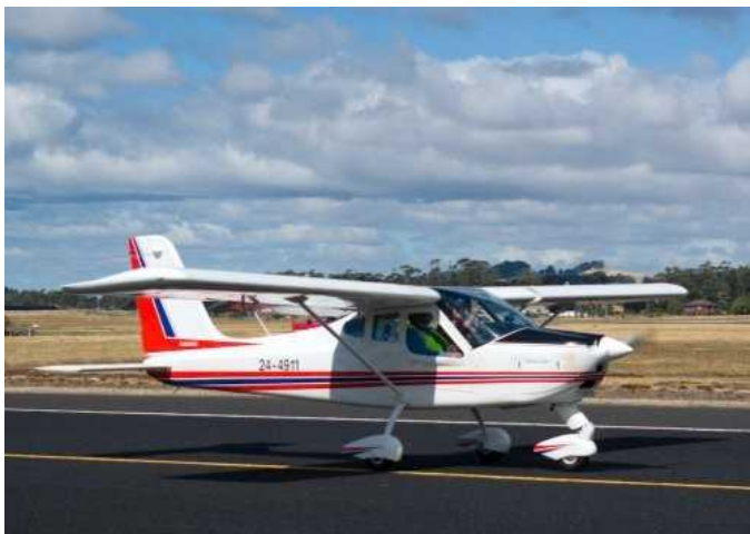
The club Tecnam.

Starting off is easy- just book in for a half-hour trial instruction flight. Fly for approximately 30 minutes with an instructor- during the flight you get hands-on experience flying a state of the art recreational aeroplane.